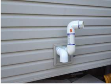
A Proper (Carrier brand) Vent Termination